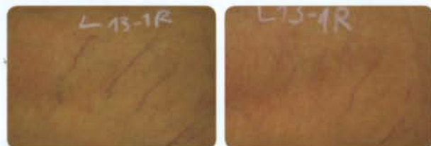
Leg veins - Before and after 1 treatment