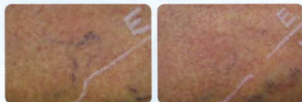
Leg veins - Before and after 1 treatment