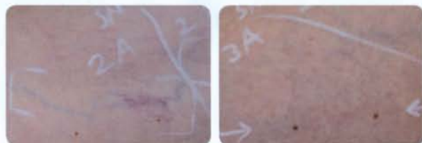
Leg veins - Before and after 2 treatments