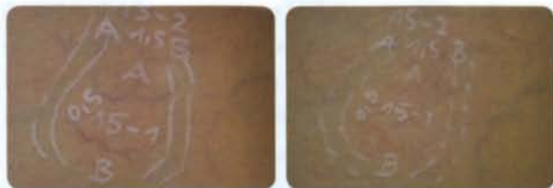
Leg veins - Before and after 2 treatments